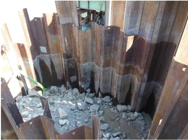
September 28, 2015 – Photo showing demolished Pier #2.