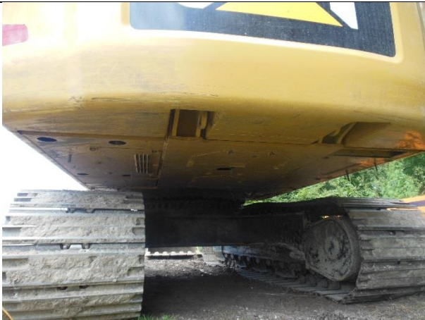
September 4, 2015 – Excavator is clean and appears to be in good repair.