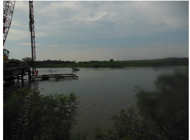
September 1, 2015 – Photo showing H pile being driven for finger #2.