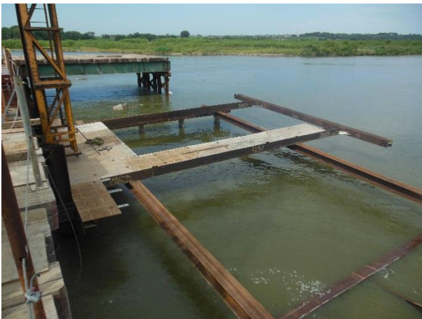
September 4, 2015 – Photo showing H pile being driven for finger #1.