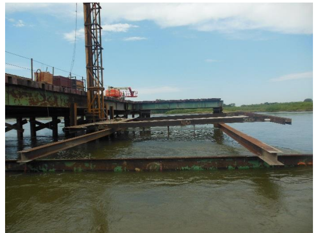
September 4, 2015 – Photo showing finger #2 in place and H pile being driven for finger #1.