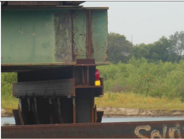
September 4, 2015 – Photo showing flashing light on upstream side of finger #2.