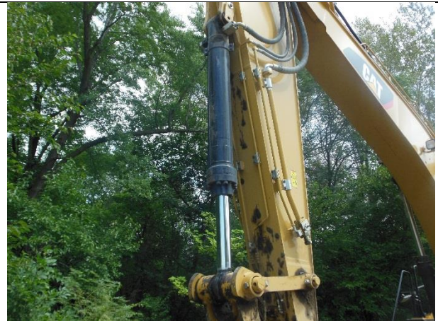
September 4, 2015 – Excavator is clean and appears to be in good repair.