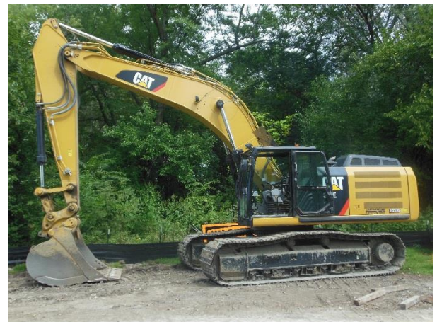
September 4, 2015 – Photo showing Cat excavator.