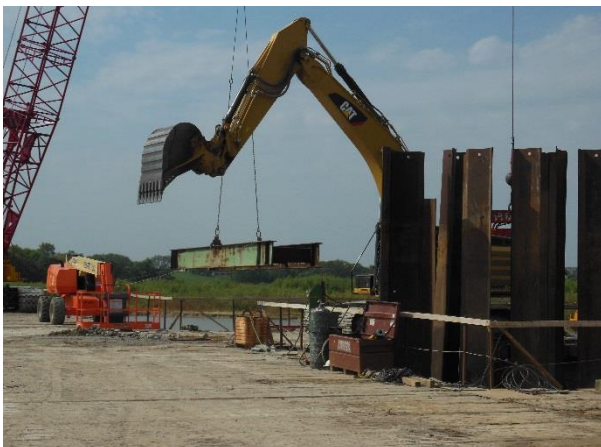
September 28, 2015 – Photo showing loose concrete being removed from within coffer dam #2 after survey.