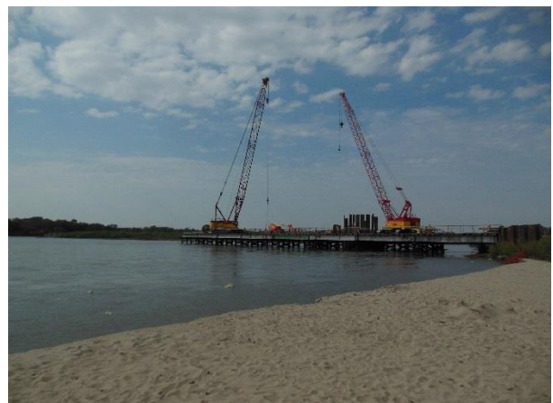
September 28, 2015 – Photo showing bridge section #8 in place.