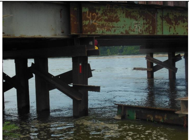
September 4, 2015 – Photo showing flashing light and reflective tape on upstream side of bent row #2.