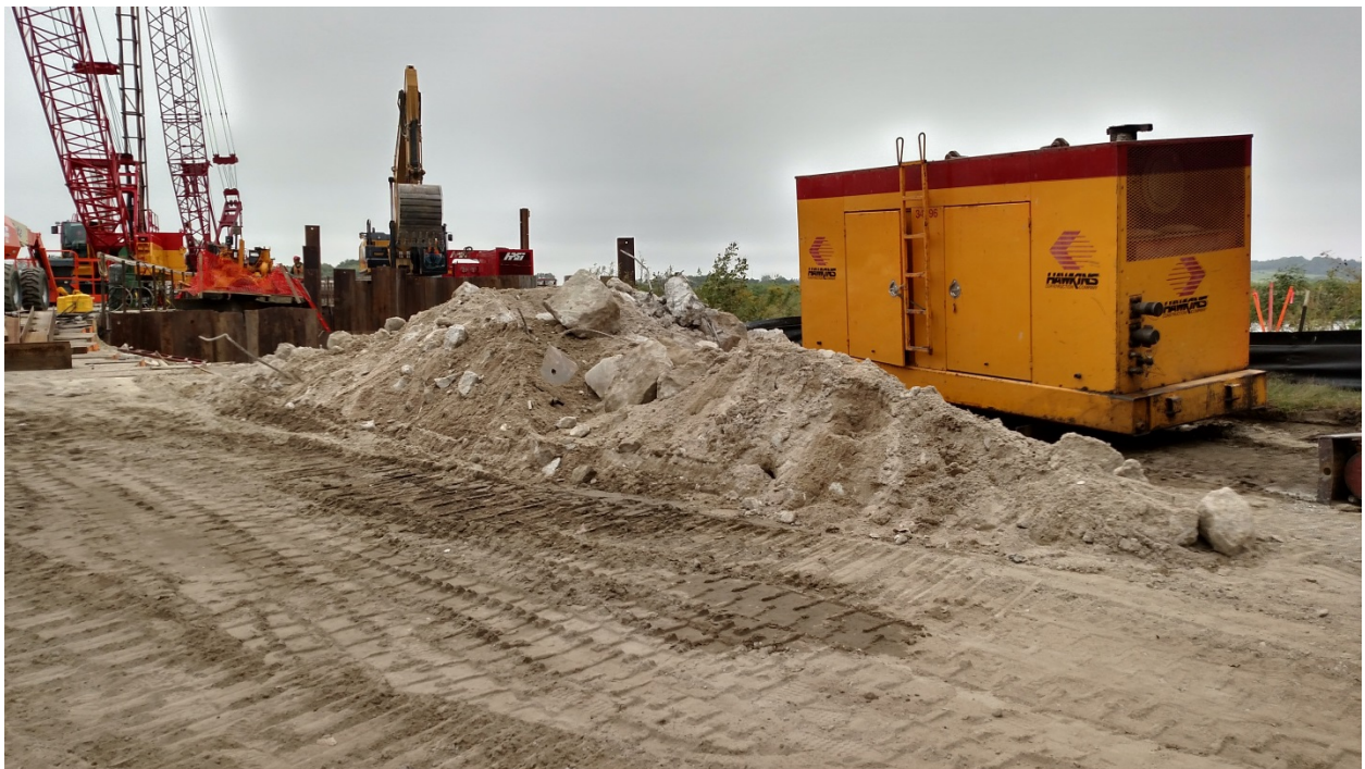
Debris from Pier 1