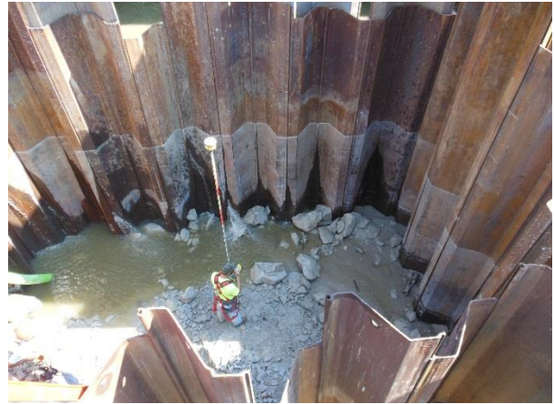
September 28, 2015 – Photo showing Pier #2 being surveyed for final elevation after demolition.