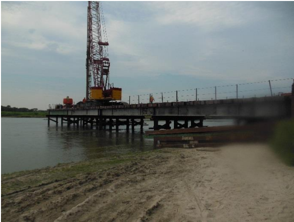
September 1, 2015 – Photo showing bridge section #4 in place.