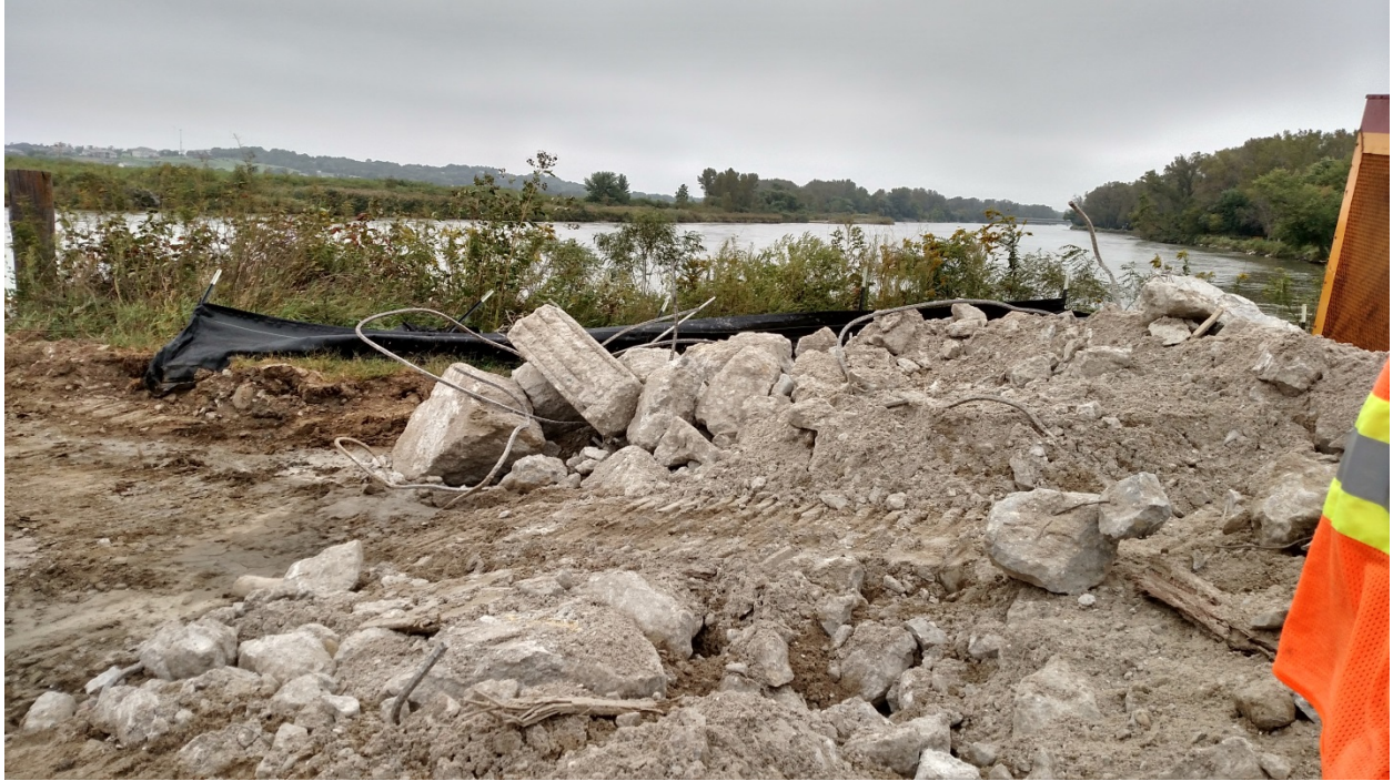
Debris from Pier 1