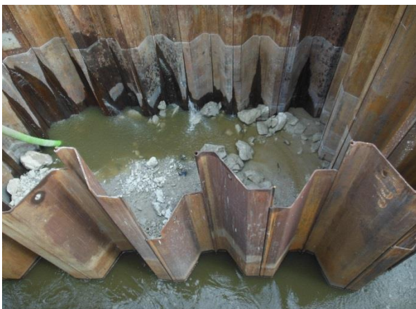
September 28, 2015 – Photo showing Pier #2 almost at completion, approximately 2 cubic yards of material was removed after this photo.