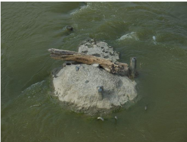
September 1, 2015 – Photo showing pier #2.